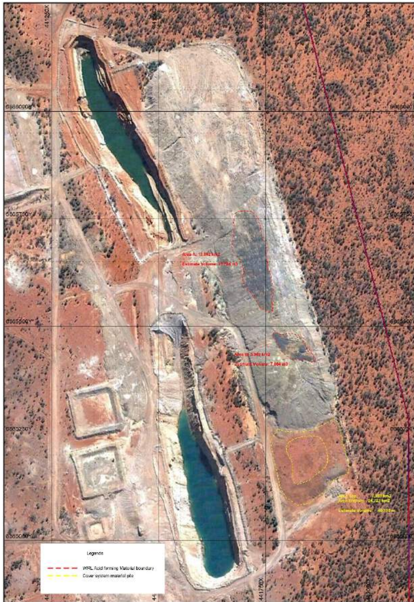
Figure 2. CTW WRL Cover System layout map

During the Quarter, the company had completed the construction of a cover system on the top of the Cork Tree Well waste rock landform and this cover system will reduce hydraulic conductivity through to the identified PAF material, effectively encapsulating it from further oxidation. Figures below shows the site construction.