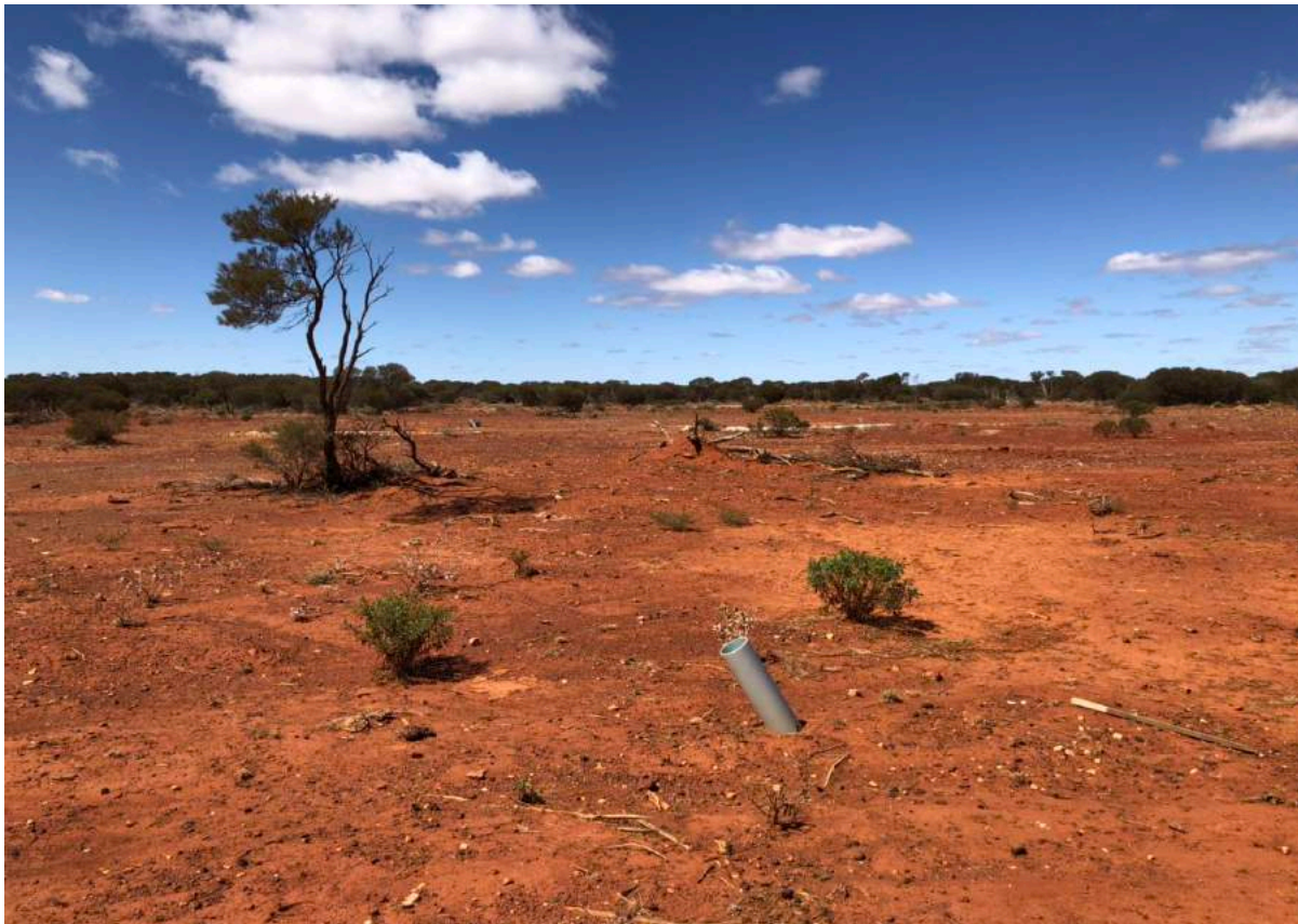
Figure 4. Drill Pad Rehab Site Picture