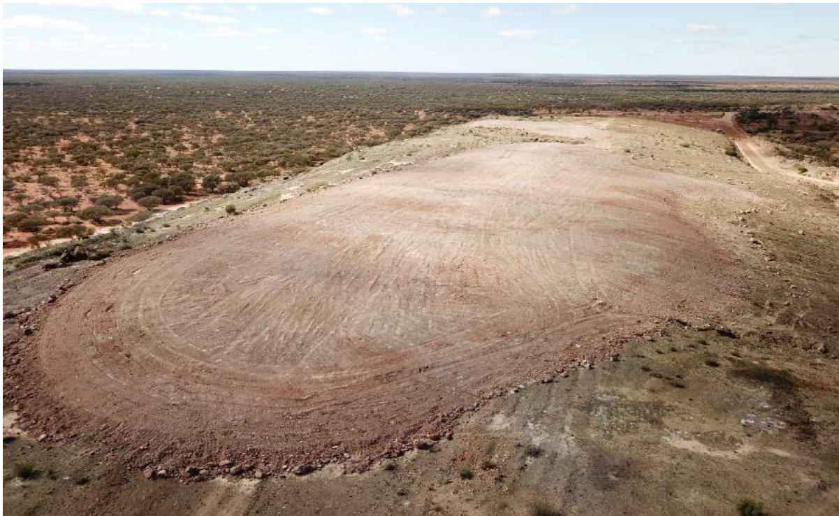
Figure 3. CTW WRL Cover System site picture after construction

In September, the company has commenced drill pad rehab work on E38/1936, E38/1937 and M38/1241. Figures below show the site progress.