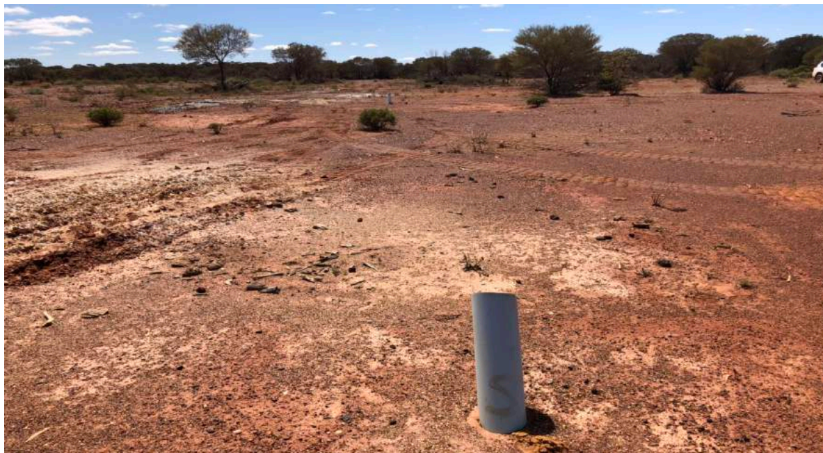
Figure 3. Drill Pad Rehab Site Picture

In September, the company has commenced drill pad rehab work on E38/1936, E38/1937 and M38/1241. Figures below show the site progress.